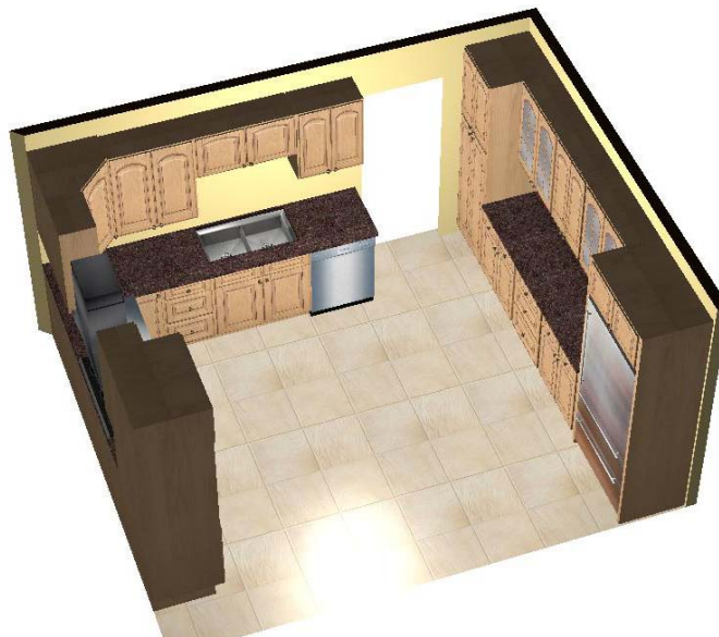
3-D Color Diagram Sample